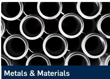
Metals & Materials